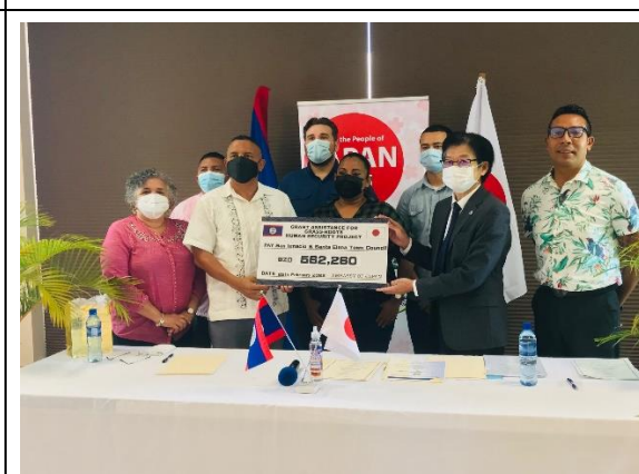
Handing Over a check to San Ignacio and Santa Elena Town Council